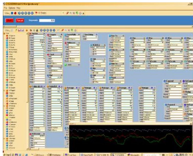
Figure 1. Screenshot of ArtWonk. The modular structure and the real time capabilities enable real-time adjustments of data mappings. The actual Listening to the Mind Listening composition is shown running here. There are separate modules for data import, data reduction, data mapping and sending out the resulting MIDI-data.

The first thing that was done was that the amount of data was reduced by a factor of 10. The original data format was sampled at 500Hz, which is a sample every 2 milliseconds. This is too fast a rate to be useful for music if you want to keep the music in sync with the original EEG trace. So the data is reduced by averaging every 10 samples in the original for 1 sample in the data here. Thus, instead of 150,000 samples, there are 15,000 samples per channel, which represents one sample every 20 milliseconds and just happens to be the default ArtWonk main loop tick interval. Not only the raw data values are used, but also the deltas. The deltas were derived simply by subtracting datum n-1 from datum n for each sample in the array, starting with the first element. All data reduction was performed by John Dunn, the developer of ArtWonk. In my sonification/composition both original data and delta's are used.