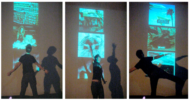
figure 1. Springboard input and image display space.

The active input space is a small raised platform (132 x 71 x 20 cm) made from a crib mattress spring, board and black cloth. States of bodily balance are determined as users move their body's centre of gravity and spatial position on the springboard input platform. The bodily balance of the user is determined using a blob tracking and analysis computer vision system developed in the Max/Jitter programming environment. The participant stands in front of a black background on the black platform. The total balance of the participant is calculated using a body centre of gravity balance index and a positional balance index and is used to control the image and sound reasoning and display engines.