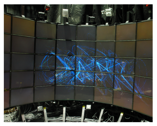
Figure 2. Display system and global view of particle simulation

The scaling parallels a transition from qualitative to quantitative data representation, revealing more and more of the meta-data values and contexts explicitly.