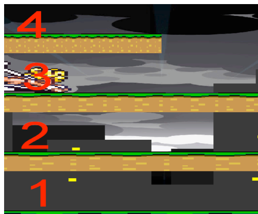
Figure 2. The four floors used in the game for platforms.