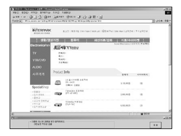
Figure 1. Image of the screen layout seen by participants in experiments. The experiment was written in HTML, JavaScript and Visual Basic 6.0, and run in an Internet Explorer 6.0 window.

Participants sat alone at a table with a Pentium PC, located in a laboratory room. The computer monitor was a 17 inch CRT display set to a resolution of 1024 x 768 pixels, with 32-bit color. The listeners wore Panasonic RP-HS40 headset, adjusted for fit and comfort, and used a standard two-button wheel mouse to respond. The frequency response of the headset was 14 Hz-24 kHz.