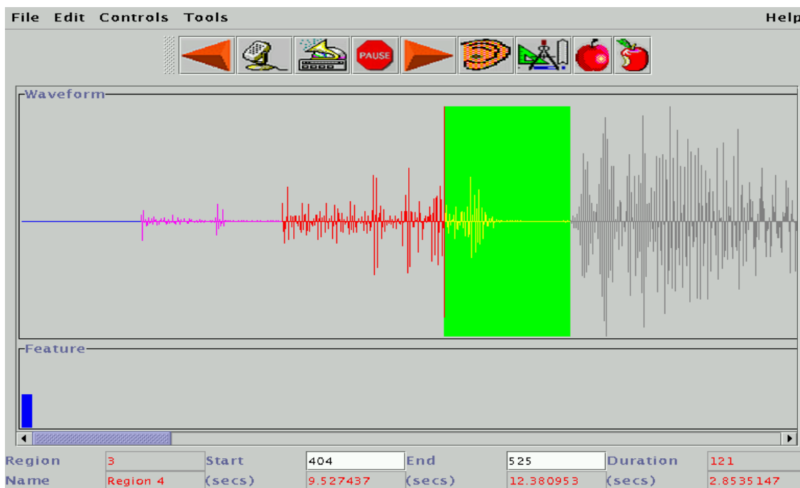
Figure 2: MARSYAS graphical user interface