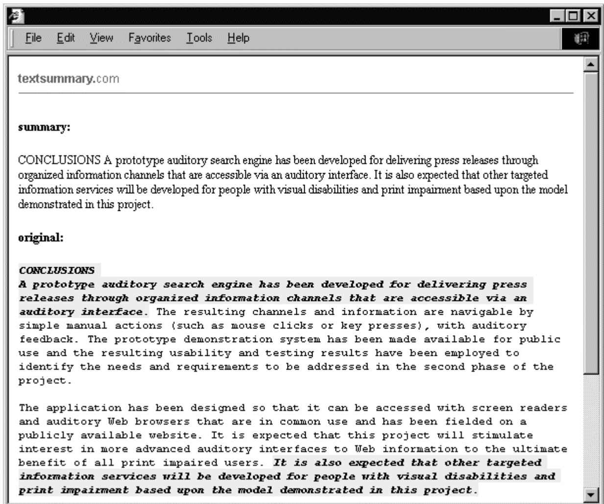
Figure 2. The result from running the summarization process on the conclusions section of this paper.

The sub-topic page displays a link to the complete article. The link label is the title of the article. There is also a second link for each article, which is a link to a summary of the article. Currently, we provide the “lead paragraph” of an article as the summary for the press releases (Figure 1 shows a sub-topic article listing for the query “computer security”). We have also created an automated process that identifies important sentences in articles and then organizes these sentences into a meaningful summary. This process will be used in future versions of the system. Figure 2 shows the output from that summarizer when run on the conclusions section of this paper. Note that only the simplest/shortest summary is generated for this example; the summarizer can generate longer summaries. A demonstration of that summarization process can be found at www.textsummary.com .